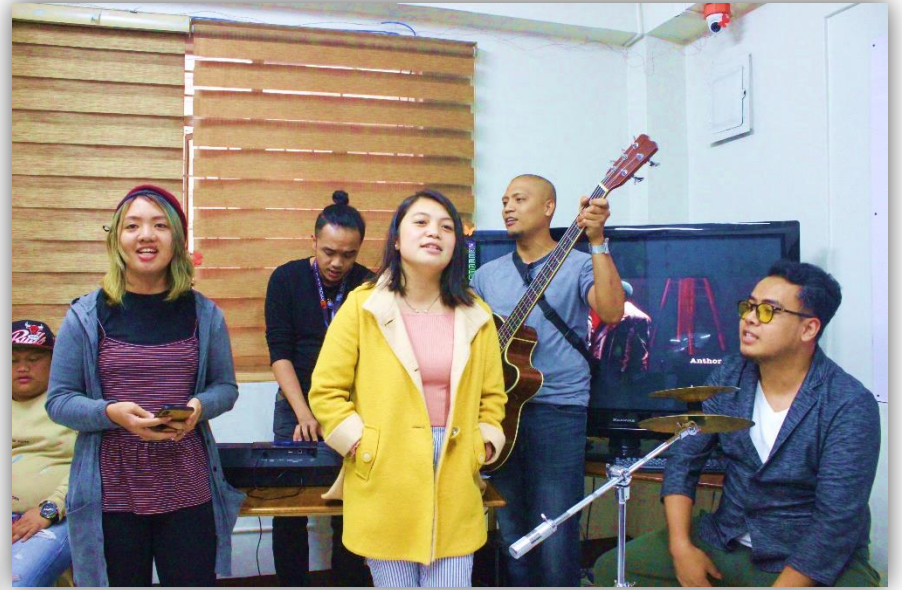
Presenting the Mintballs who sang "Seasons of Love" that made all the attendees' hearts feel warm this Valentine's Day!

Valentine's Day is meant to express all kinds of love in many unique ways. The love that was spread this year will always be remembered by pictures taken, messages written, and efforts put into the preparation of this occasion that resulted to an outcome that everyone can and are most proud of. All in all, it was work that stems, flourishes and blooms from the heart.